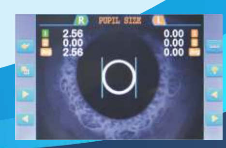
Pupil size measurement

With the pupil size measurement function, which enable to record the pupil size and refraction result in different measurement environment, and provide a reference for the prescription.